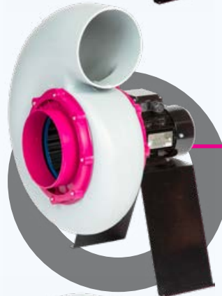
SEAT 25 Air flow rate: 500-3000 m 3 /h