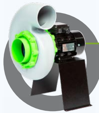
SEAT 15 Air flow rate: 50-700 m 3 /h