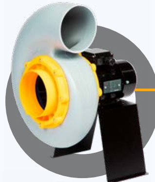
SEAT 20 Air flow rate: 200-700 m 3 /h